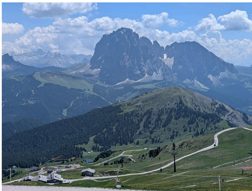
View of Seceda from our hike